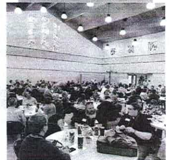
Community Meal with Council Bluffs Residents